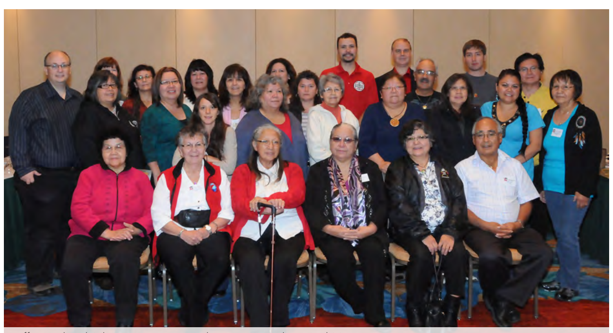
Staff, Board and Advisory Committee at the 2012 Annual General Meeting

Advisory Committee members are listed on page 11 with the language group they represent.