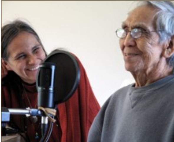
FirstVoices language revitalization initiative.